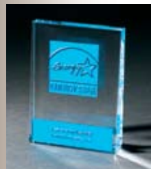
XC21 The most quiet and efficient central air conditioner you can buy 5

For three years in a row, Lennox has been named an ENERGY STAR Partner of the Year. Lennox is the first and only heating, ventilation and air-conditioning (HVAC) manufacturer to receive this prestigious award, which reflects our ongoing commitment to